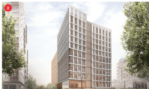
Lever Architecture (Rendering)

Robinson is a pioneer in designing tall buildings that use wood, not concrete or steel, to bear their weight. Albina Yard is only four stories, but it's the prelude to a more ambitious project: Framework [2], a 12-story mixed-use tower that will soon rise in Portland's Pearl District. When it's finished (likely in 2019), it will be the country's tallest human-occupied all-wooden structure.