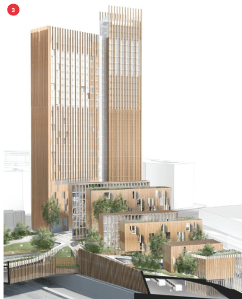
Michael Green Architecture (Rendering)

Although we've been building with trees since prehistoric times, they are having a moment, architecturally. Wooden structures similar to those in Portland have recently been built in Sweden, Finland, and the U.K., and a 24-story wooden building is under way in Vienna. Architects are even dreaming up wooden skyscrapers, such as a 35-story tower proposed for Paris [3] by Michael Green Architecture, a Canadian firm that designed an eight-story timber office building in British Columbia and a seven-story one in Minneapolis. (Although U.S. building codes generally bar wooden structures more than 85 feet tall, the federal government has recently promoted research into building with wood, hoping to revive the domestic timber industry.)